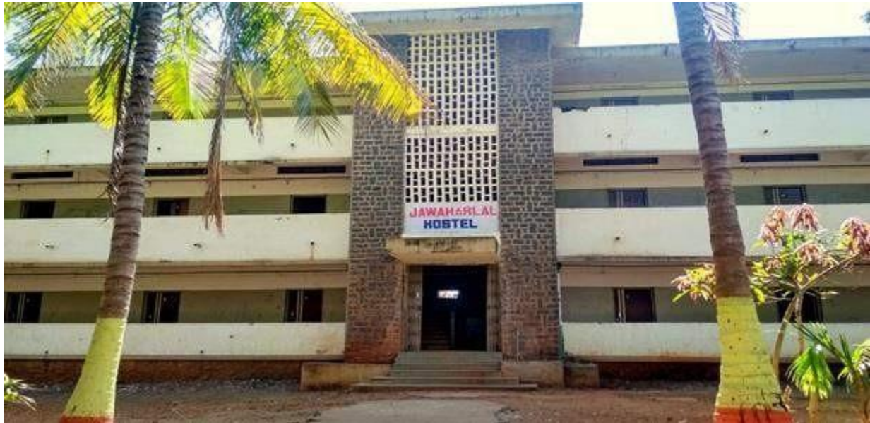
T.K.I.E.T.P BOY'S HOSTEL

Tatyasaheb Kore Institute of Engineering & Technology (Polytechnic), Warananagar