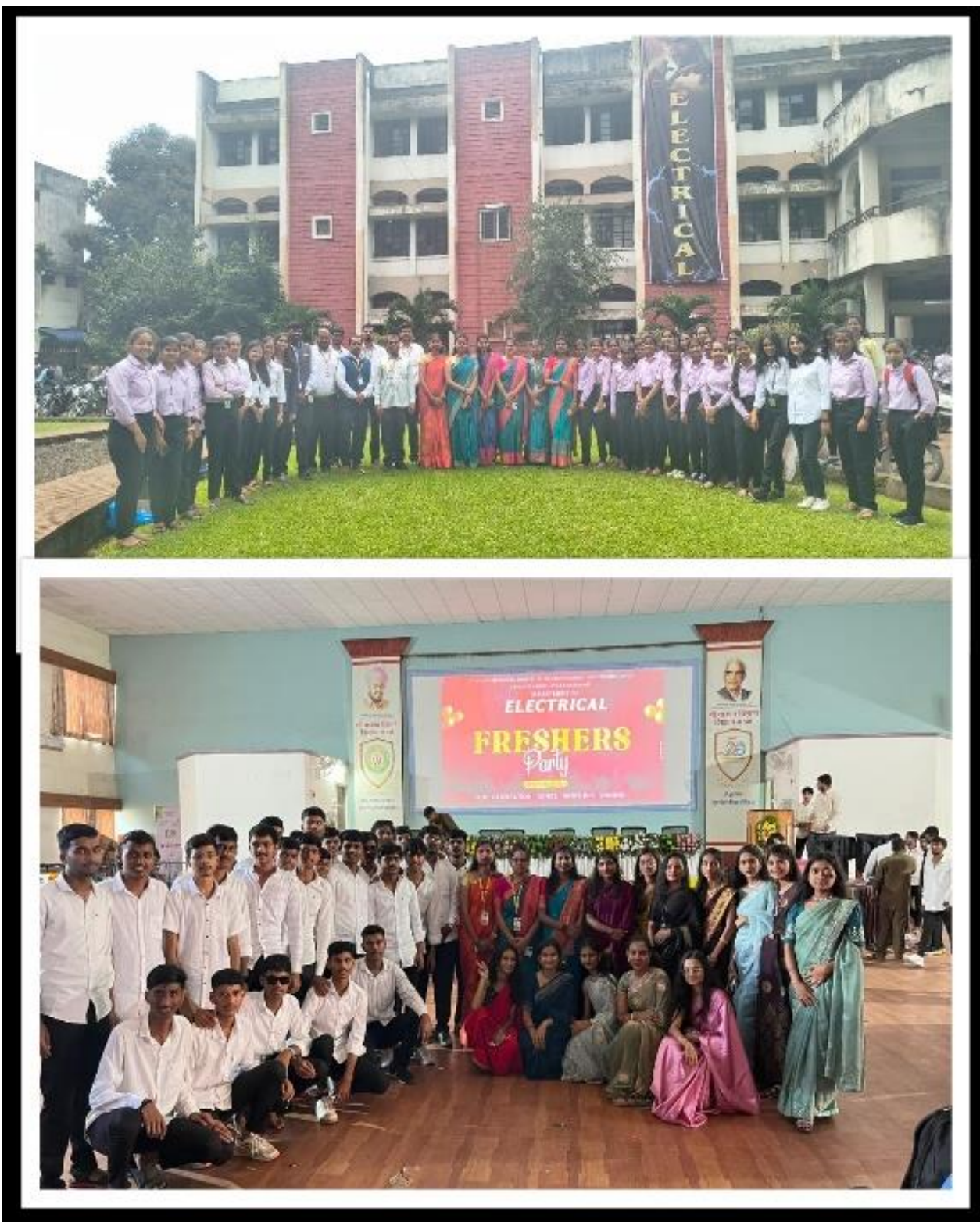
WELCOME FUNCTION OF FIRST YEAR & DIRECT SECOND YEAR STUDENTS